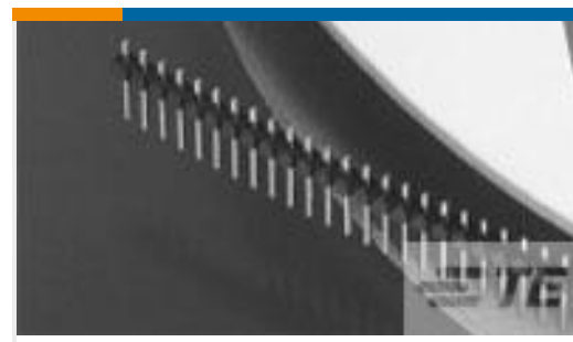
TE Part # 146870-1 B/A REELED SRST HDR ASSY 30 AU