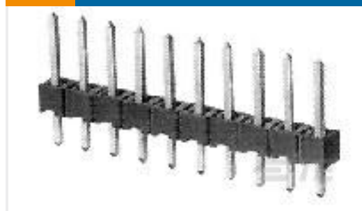
TE Part # 2-103321-5 25 MODII HDR SRST B/A .100CL