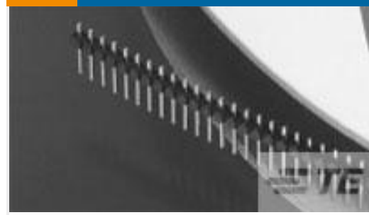
TE Part # 5-146868-1 B/A REELED SRST HDR ASSY 30 AU