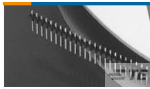
TE Part # 146860-1 B/A REELED SRST HDR ASSY 15 AU